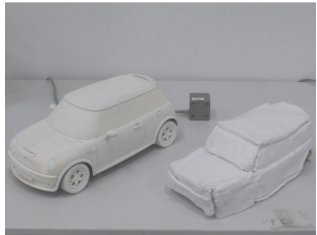
Figure 1: Quimo modelling material mock-up next to a non-deformable material.

Our goal has been to explore how the concept phase of the modeling methodology can be enriched using SAR technologies to allow designers to visualize their concepts with higher detail and provide a more flexible modeling environment.